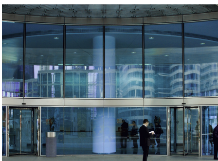
Headquarters to branch offices

Alcatel-enterprise Omniswitch family provides an easy scalable network solution that is power efficient and requires a minimal deployment footprint Enterprise wide area networks connect all aspects of the enterprise.