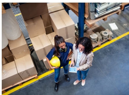
Manufacturing plants to supply chain