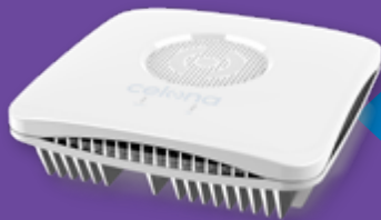
The first 4G/5G multimode AP