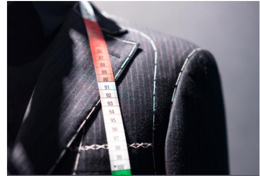
Industries & Customisation