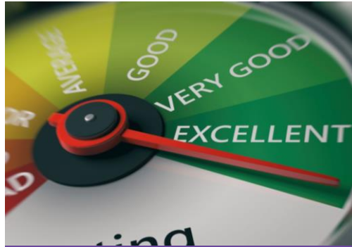
Optimisation & Adoption