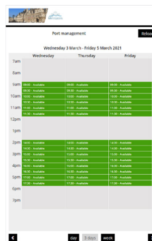
Figure1. The visual calendar