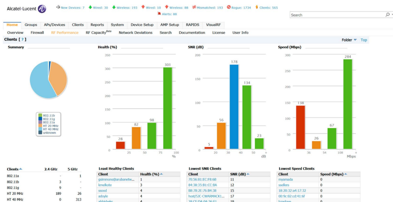
Figure 1. OmniVista 3600 delivers identity-based monitoring and comprehensive management to multivendor wireless, wired and remote enterprise networks.